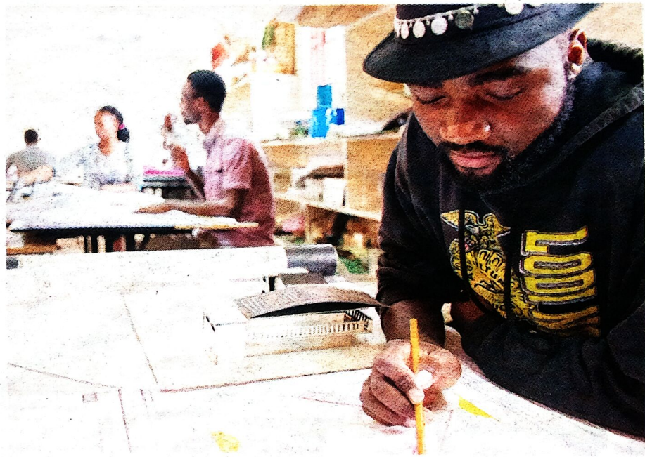
A student doing an assignment at International University of East Africa

is what started his drive from the world of humanities to that of sciences. While working at Obafemi Awolowo University, he got a trip to perform in the US in 1980. Some senior dons in Nigeria had already connected him to universities there.